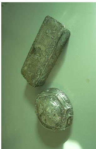
LOTS 109 & 110