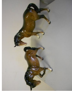
LOTS 181 & 180