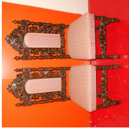
LOT 419 (2 of 6)