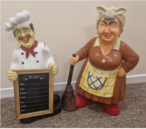
295 & 294